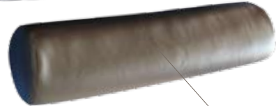
bolster cushions 62cm or 81cm