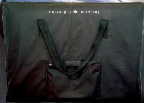
massage table carry bag